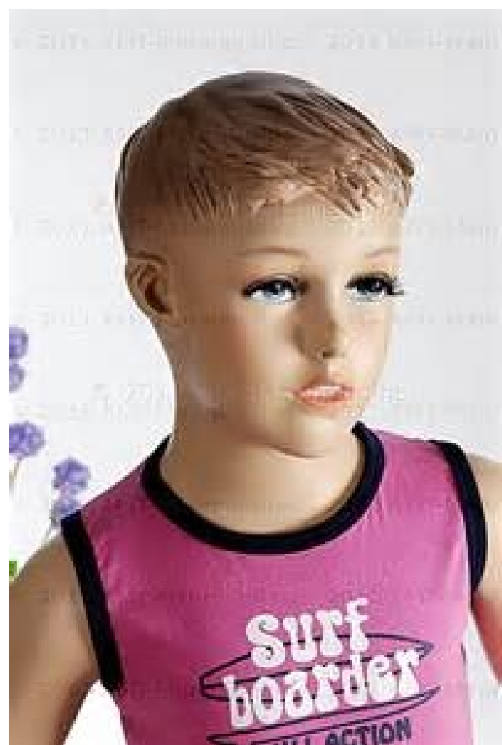
Mannequin head stand uk. Mannequin head stand amazon. Mannequin head stand for chair. Mannequin head stand near me. Mannequin head stand price. Mannequin head stand walmart. Mannequin head stand for wigs. Mannequin head stand in store.